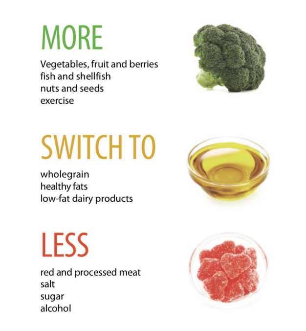
FIGURE 2 Sweden: an abbreviated food guide. Reproduced from reference 24 with permission.

juice should not count for more than 1 serving per day of fruit, or that whole fruits should be preferred to fruit juice. For example, the South African dietary guidelines state that juice is "acceptable as an occasional substitute" (25, p. 165). A few countries (7%) explicitly deliver negative messages