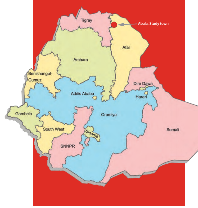
Figure 1 The study town location map

Mohammed Hussein is a head of the Afar Disaster Prevention and Food Security Programme Coordination Office, Ethiopia.