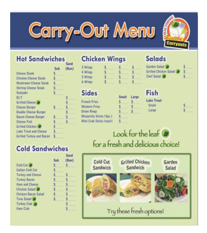
Baltimore Healthy Carryouts sample menu