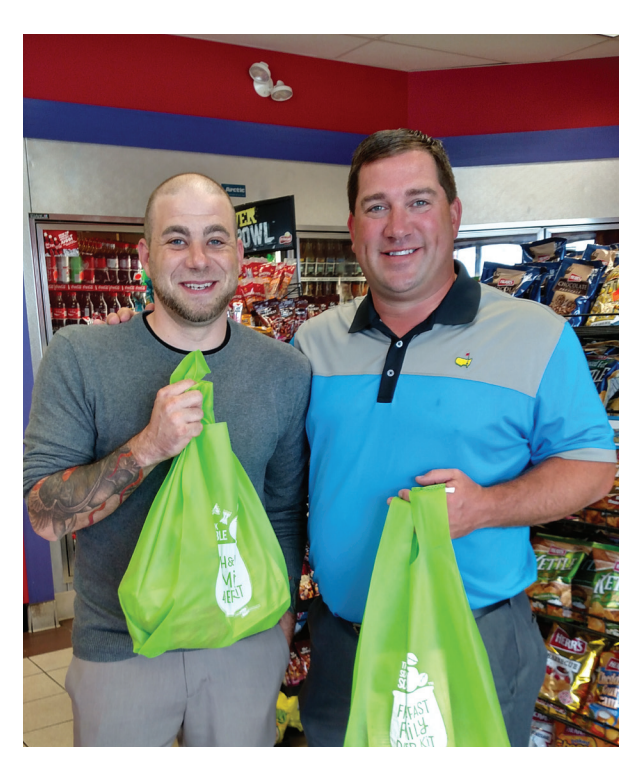
Customers purchasing the Fresh & Fast Family Dinner Kit.

Square One Markets, a NACS member located in Bethlehem, Pennsylvania, embraced the concept of developing convenient, all-in-one, healthier products to go. In September 2015, Square One Markets launched the Six O'Clock Scramble Fresh & Fast Family Dinner Kit, the first all-in-one healthy family dinner option sold at a